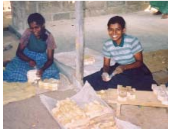
Two of Ibu Seelawathi's granddaughters sand wooden puzzle pieces by hand in their workshop in Sri Lanka. These puzzles are later sold in Ten Thousand Villages stores such as the one in Dayton, Va.

We saw firsthand the difference between the working conditions and income of the employees of the fair trade workshops and the commercial