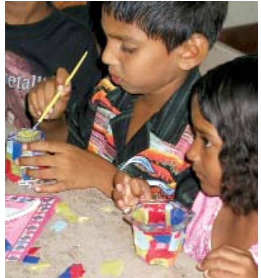
Trinidadian children concentrate on a craft project during Vacation Bible School in Summer 2003.