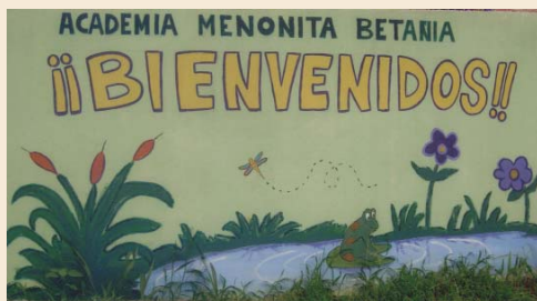
(above) A mural painted on a wall at Academia Menonita Betania is a “welcome!” (below) Millyellen and Drew Strayer paint a classroom building.