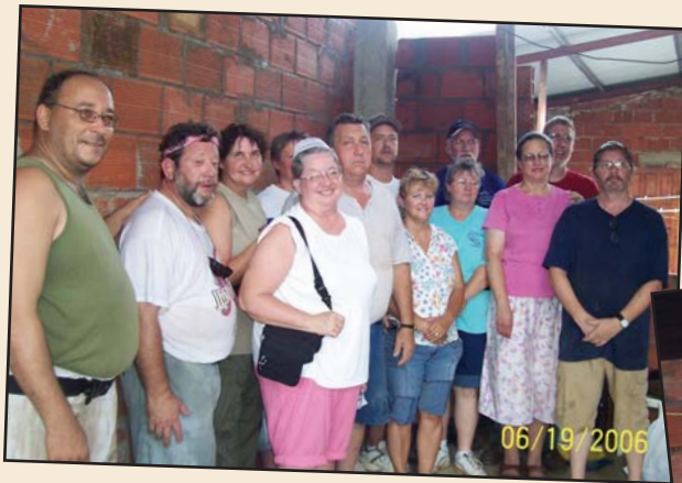
(left) The PIM team from Mountain View Mennonite Church that went to Trinidad.