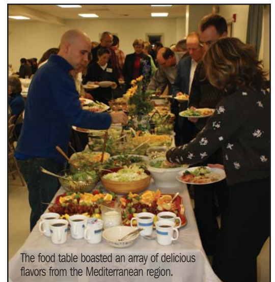
The food table boasted an array of delicious flavors from the Mediterranean region.