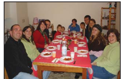
The Mediterranean region "missionary family" anticipates a delicious lasagna meal together during the holiday season.